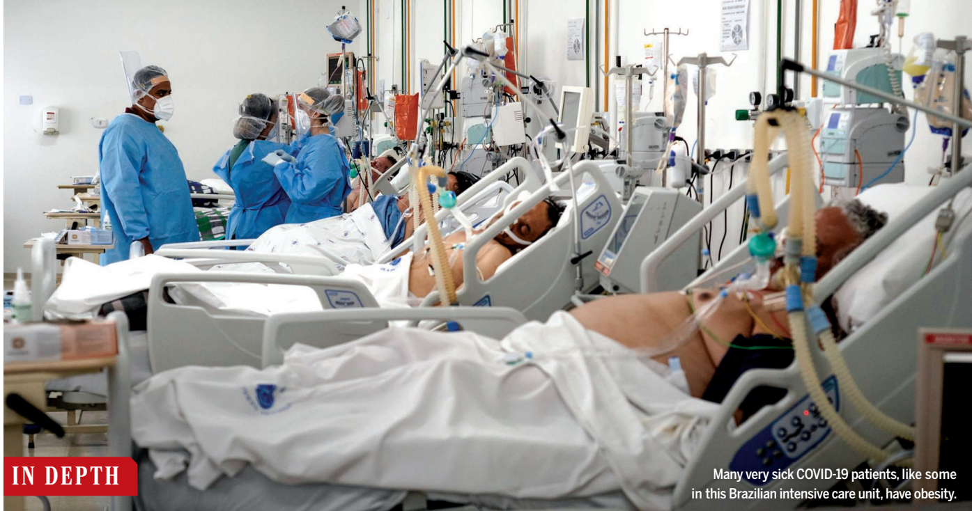
Many very sick COVID-19 patients, like some in this Brazilian intensive care unit, have obesity.